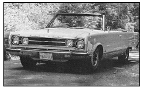
1967 Plymouth Hemi Satellite Covertible

Roster Corrections: Check your old Rosters. There were several typo's and a few of you have moved or some how your information needs to be updated. Maybe you have bought another Plymouth or sold your Plymouth. Let us know ASAP so things will be accurate.