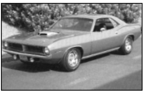
1970 Plymouth Hemi Cuda Coupe